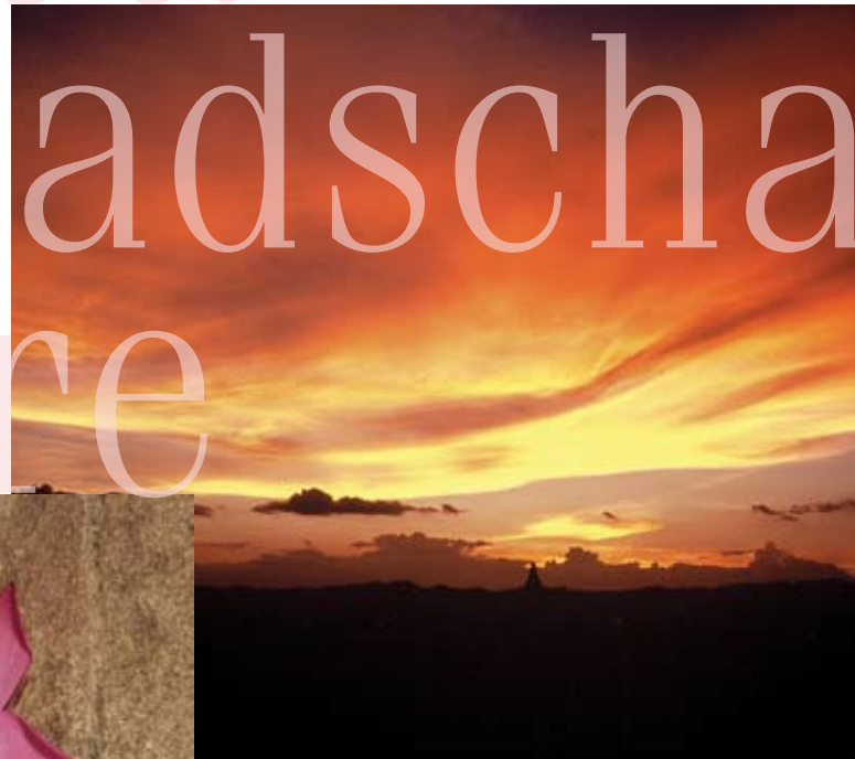
Figure 2. A marriage made in heaven. The color of a padparadscha has been described by some as the marriage between a lotus flower and a sunset, each shown above.